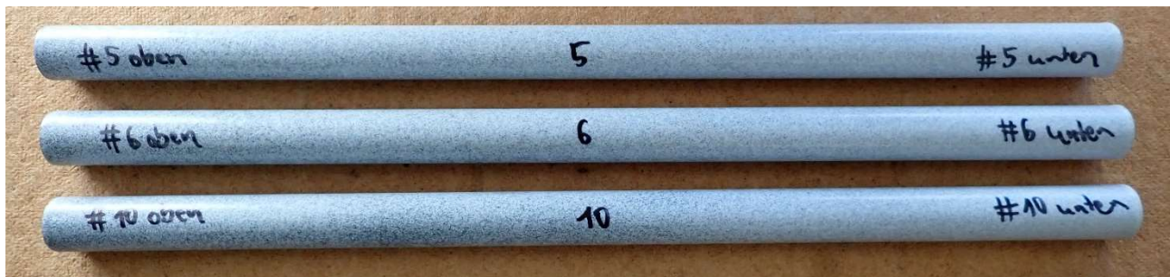
Picture 2: Opposite surface of investigated dowels before corrosion testing.