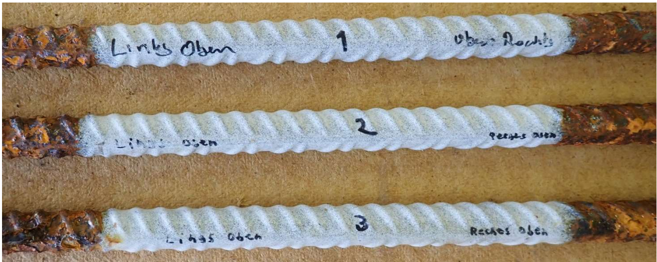
Picture 7: View of plastic coated area of tie bars after 240 hours salt-spray. No rust was observed in regarded area of lateral surface (200 mm in centre of tie bar).