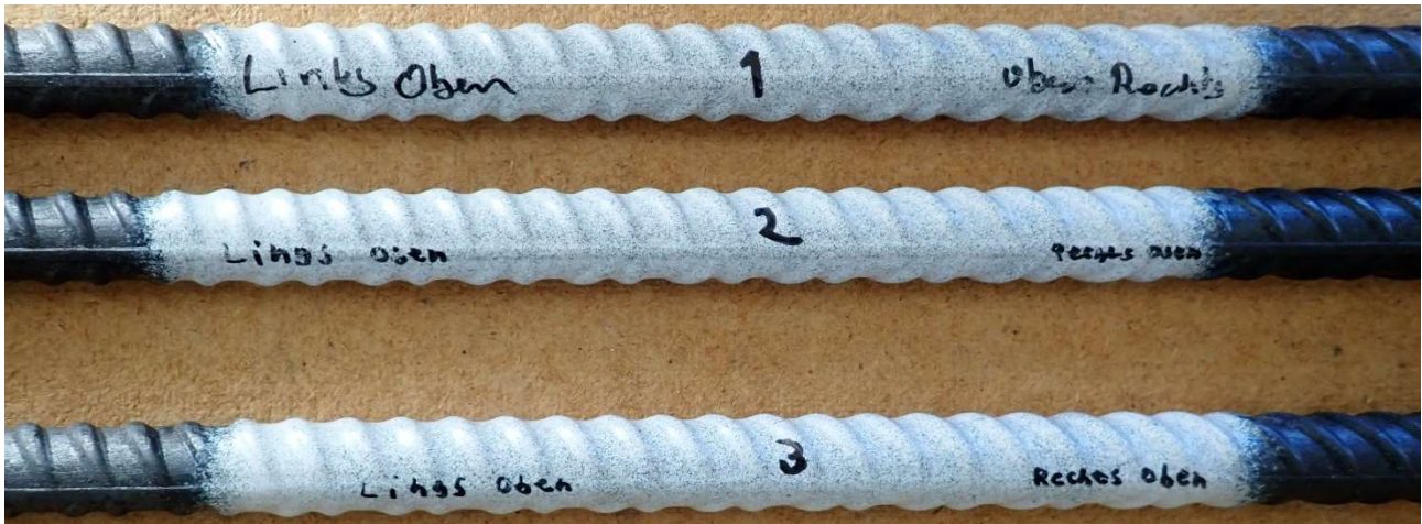
Picture 5: View of plastic coated area of tie bars before corrosion testing.

On all three investigated tie bars no rust was observed after 240 hours of neutral salt-spray in regarded area of lateral surface. See pictures 5 and 6 for view of tie bars before testing and pictures 7 and 8 for condition of tie bars after corrosion test.