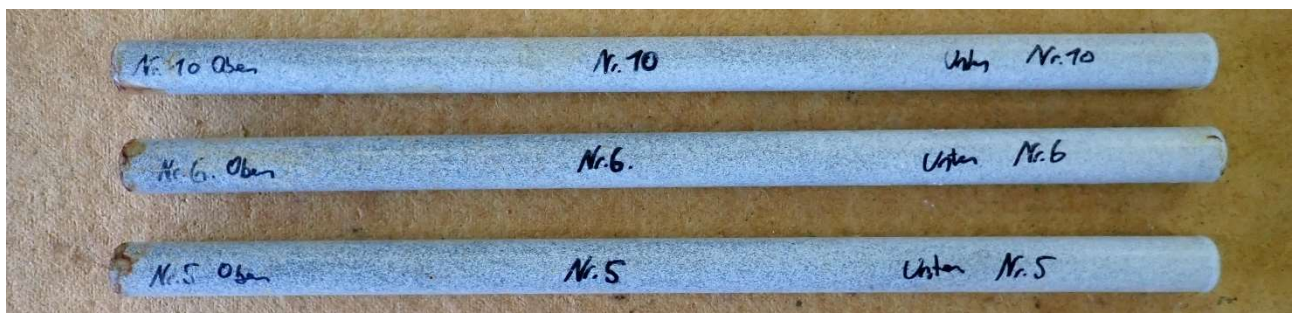
Picture 3: Plastic coated surface of dowels does not show any rust in regarded area of lateral surface after 240 hours at neutral salt-spray.