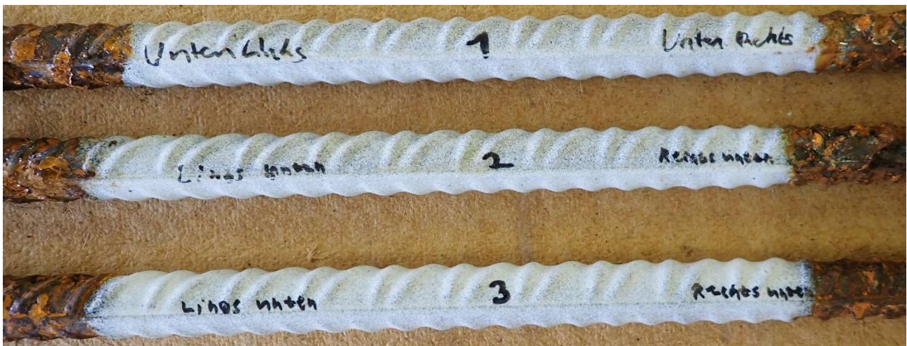
Picture 8: Opposite view of plastic coated area of tie bars after 240 hours salt-spray. As well, no rust was observed in regarded area of coated lateral surface.