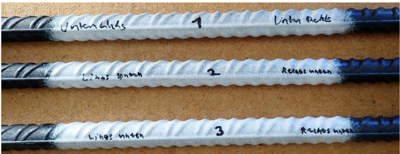
Picture 6: View of opposite side lateral surface of plastic coated area of tie bars before corrosion testing.