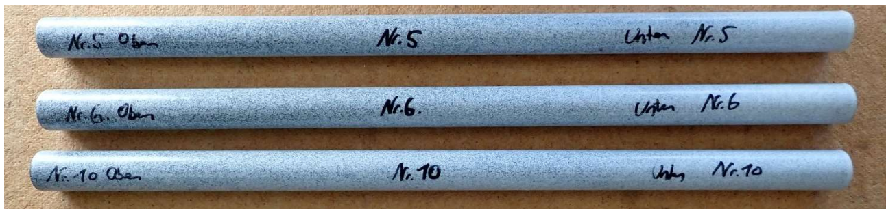
Picture 1: Plastic coated surface of investigated dowels before corrosion testing.